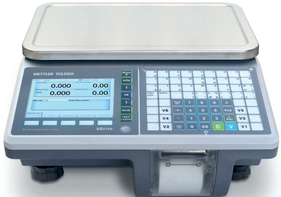
bDrive Compact Scale

With quick and accurate weighing and service, METTLER TOLEDO's bDrive is a versatile, multi-functional counter scale with receipt printer for both store and mobile businesses. Designed for speed and durability, bDrive offers retailers enhanced, comprehensive weighing processes that will reduce customer wait times and withstand harsh environments.